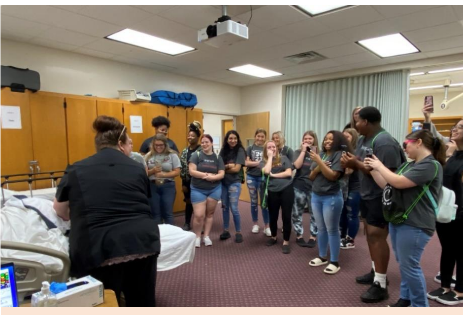
Students witness a labor and delivery simulation.