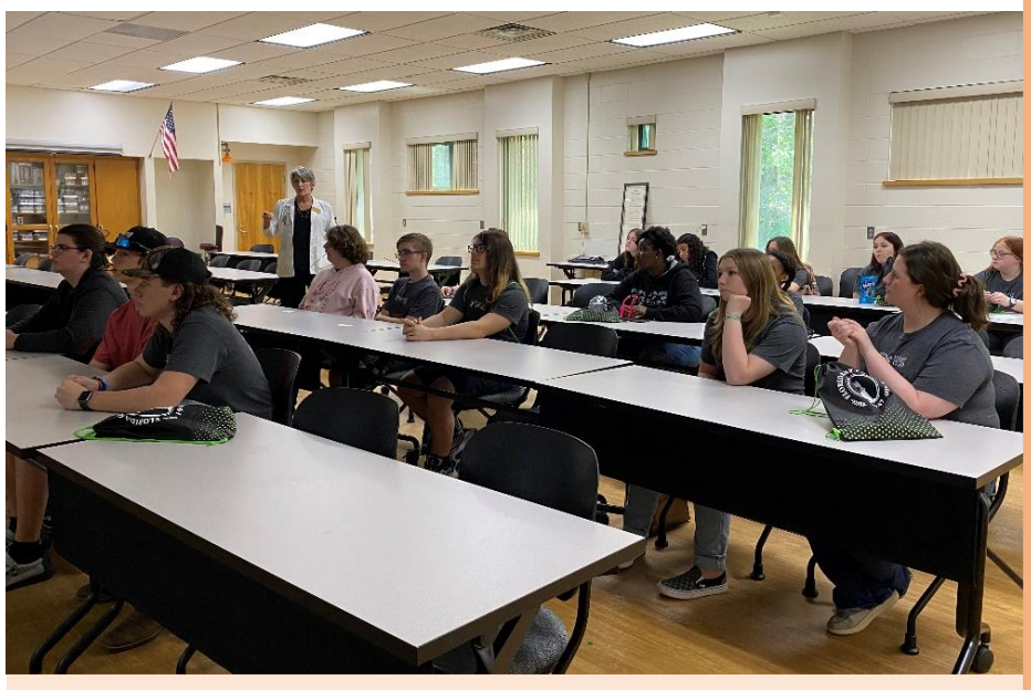
Students observe a presentation about the various health science programs offered at FGC.

At the conclusion of the day's activities, students headed to The Grill for lunch on campus. "The day was truly enjoyable and we're looking forward to seeing them in the future as FGC students," said Espenship.