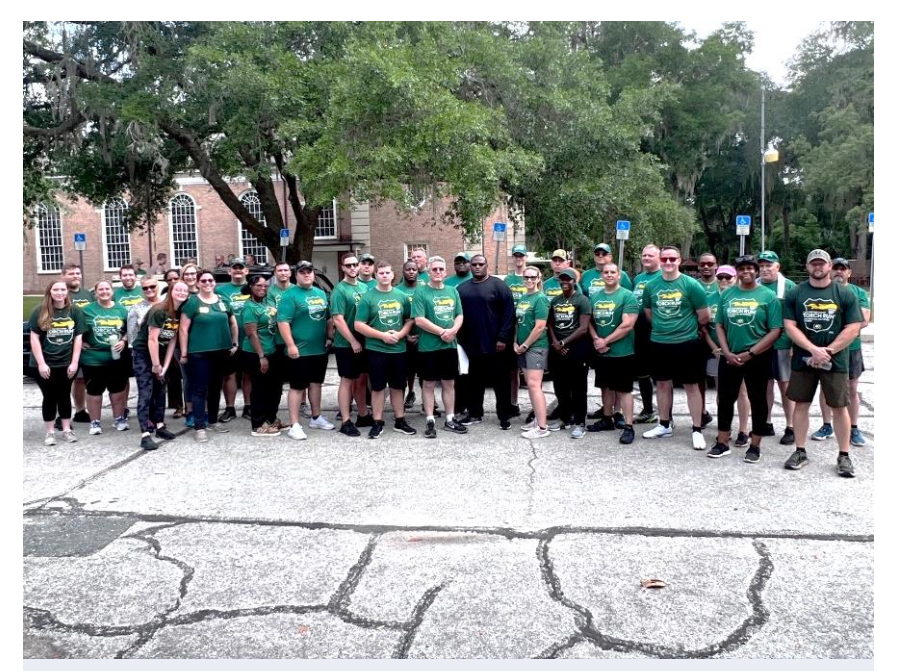
Florida Gateway College administrators along with faculty, staff, and students from the Law Enforcement division and Department of Nursing and Health Sciences gather for a photograph in front of the Columbia County Courthouse.