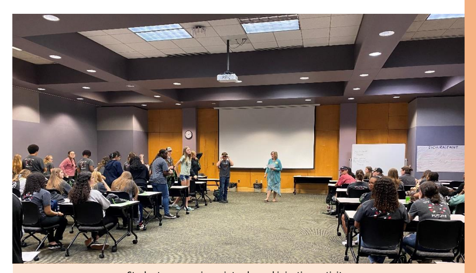
Students engage in an intradermal injection activity.